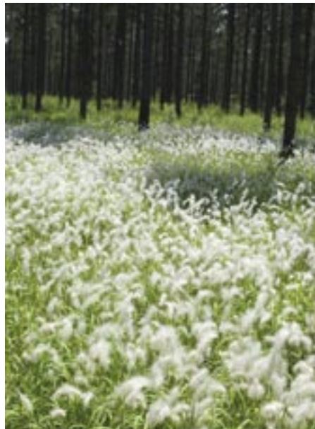
Cogongrass seedheads – pretty but problematic.

For more information, ID and photos, and links to cogongrass websites, go to http://www.cofc.edu/~everettj/cogongrass.html . Please look for this menacing grass, and contact us immediately if you suspect a population. Tell everyone about it and its