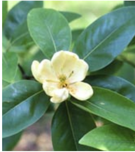
M. virginiana , an evergreen shrub or small tree of the coastal plain.

The two evergreen magnolias, Magnolia virginiana (sweetbay magnolia) and M. grandiflora (southern magnolia or bull-bay) are both coastal plain species. Magnolia virginiana is a shrub-like, often multi-stemmed, small tree common to the acidic swamps, bogs, pocosins, and other moist soils of the coastal plain east of the fall line. It is easily our most common magnolia and, in fact, ditching along roadsides actually has benefited this species by providing suitably moist habitats for it. From the Savannah River valley westward through the Gulf States, sweetbay is represented by M. virginiana var. australis , which grows into a much larger, single bole tree. Both varieties produce very fragrant, small (4 inch) white flowers from May to July. The silver backed leaves are particularly noticeable when exposed by a gust of wind.