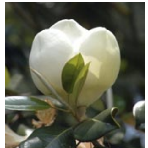
Our old friend, M. grandiflora , famous around the world.

Our southern magnolia, M. grandiflora , and the other SC native magnolias have been with us for a very long time. We need to work diligently to preserve and protect their habitats, if we are to continue to have these wonderful trees to appreciate.