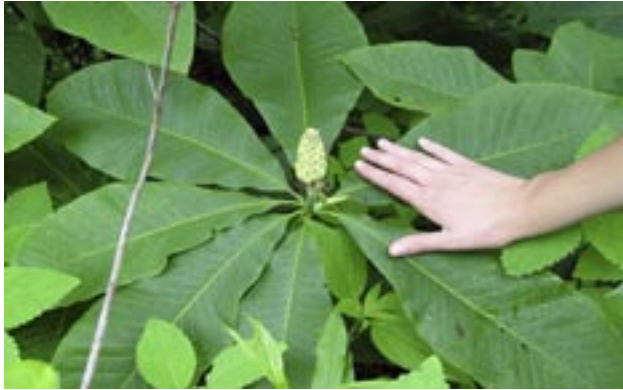
Leaves of M. tripetala

Magnolia tripetala , or umbrella magnolia, is represented in the southeastern US (including SC) in scattered populations that are often widely separated. This small, sometimes multi-stemmed, tree resembles M. fraseri , but with much larger leaves (to 20 inches long) that are tapered at the base (no “ear-lobes”). Its large white flowers (to 11 inches) appear