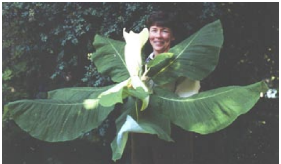
M. macrophylla, with huge leaves and flowers, but endangered in SC.