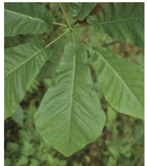
The "umbrella" in M. fraseri.