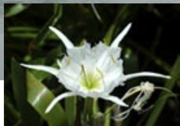
Shoals spider lily at Landsford Canal on the Catawba.

peril as much as the plant. River shoals have historically been exploited in the early 20th century for industrial water power. As dams were built, the traditional habitat of the lily was drowned. The reduced flow out of the impoundments, coupled with construction along the river has caused the accumulation of sediments, to the detriment of the lilies. In recent years this has been apparent in Alabama; biologists have observed the population of lilies in the Cahaba River near Birmingham declining from year to year. While this has not been apparent on the Catawba, impact on the Landsford spider lilies should be monitored as our area grows.