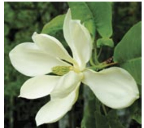
M. fraseri , common in northern Oconee, Pickens and Greenville Co.

The most common of these, Magnolia fraseri , is endemic to the southern Appalachians, and is common in forests along the foothills and mountains of Pickens, Oconee and Greenville counties. A medium to large tree associated with Tuliptree ( Liriodendron tulipifera ), Chestnut Oak ( Quercus montana ) and other cove hardwoods, M. fraseri distinguishes itself by its large kite-shaped leaves up to 12 inches long, with auricu- (See Magnolias , page 4)