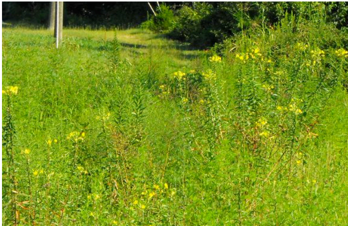
Colony of Evening Primrose on HWY. 185 near intersection of HWY 25 at Hodges, SC on 8/14/2014.

Rapunzel, a wildflower ( Oenothera biennis ) known here as "Evening Primrose," produces its golden yellow blossoms along Southeastern roadsides from July to September. Each evening some open and remain open all night, closing the next morning. Its pollinators are mainly moths that are active at night. Flowers may open so rapidly at dusk that they can be caught in the act!