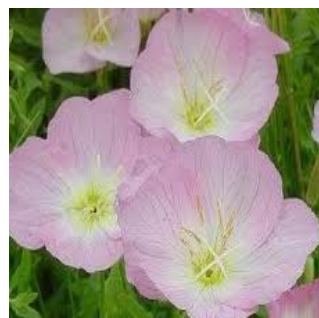
Showy Evening Primrose blossoms.