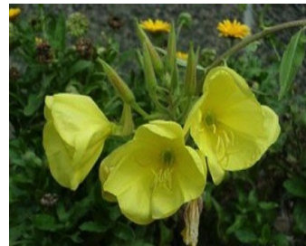
Close up of three primrose blossoms.

Though native to temperate regions of America, Evening Primrose species have been naturalized in Europe, where they have long been valued for food and medicine. The plant is called "rampion" or "rapunzel" in German. The roots are harvested, cooked and used in salads. It is the same healthful, edible herb that is featured in Grimm's fairy tale, and for which the child Rapunzel was named! Many of the web sites with information about this species originate in Germany.