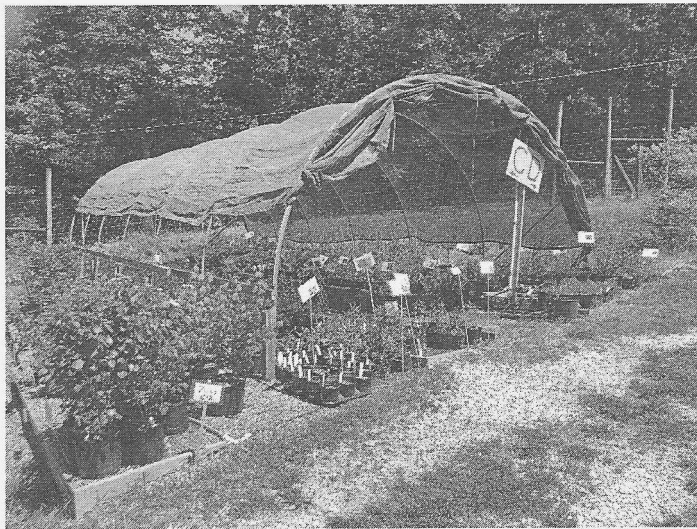
The Greenhouse in May