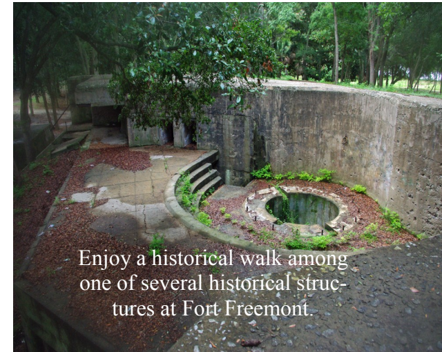
Enjoy a historical walk among one of several historical structures at Fort Fremont.