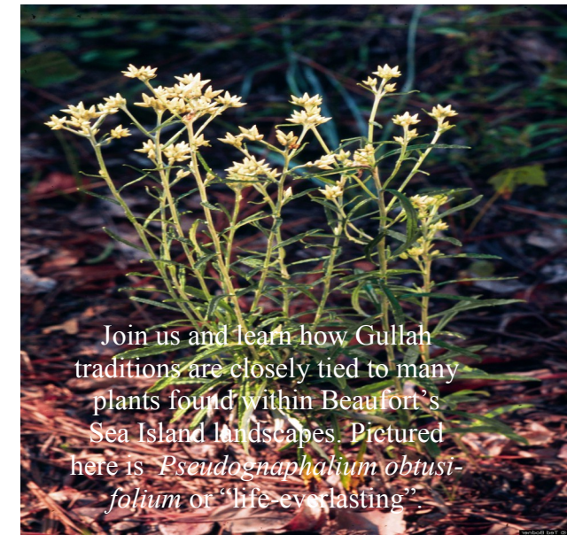
Join us and learn how Gullah traditions are closely tied to many plants found within Beaufort’s Sea Island landscapes. Pictured here is Pseudognaphalium obtusifolium or “life-everlasting”

Accommodations can be reserved by contacting Laura Lee Rose (843) 255-6060 x117 for lodging on campus Cottage at Penn Center ..... Quality Inn St. Helena Island Resorts - Fripp and Harbor Island Hotels - Beaufort, Port Royal