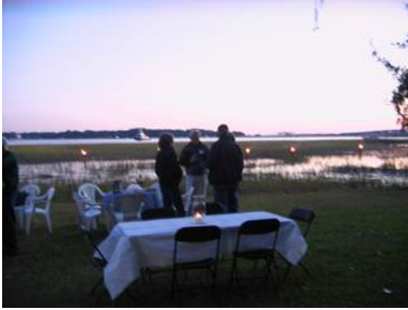
Marshlands Oyster Roast