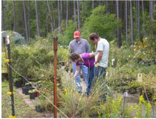
Plant selection at Naturescapes