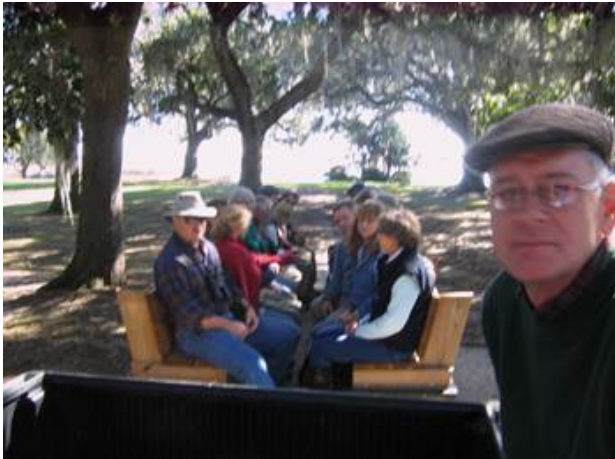
Nemours Plantation Field trip