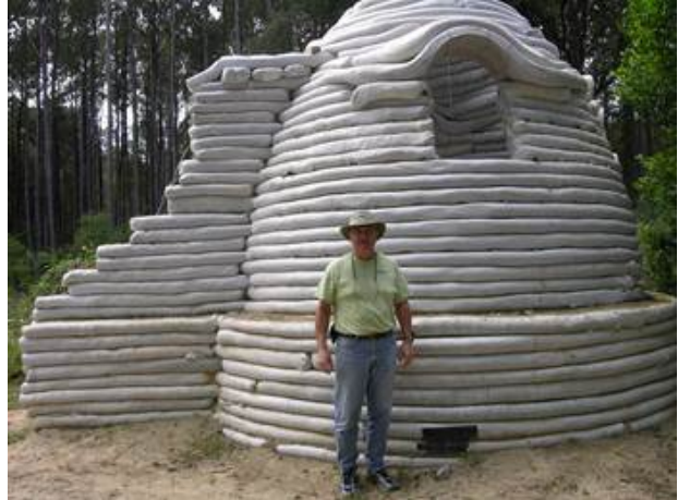
New earthen dome at Naturescapes

Greetings from your still but sometimes President of the Southcoast Chapter SC Native Plant Society,