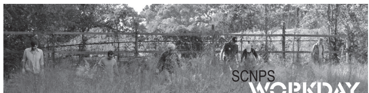
Walking the "Skip Still Meadow," on October 19th. Grasses and forbs were planted; invasives removed.

For a map and more information, visit http://www.scnps.org