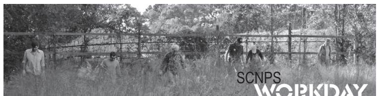
Walking the "Skip Still Meadow," on October 19th. Grasses and forbs were planted; invasives removed.

For a map and more information, visit http://www.scnps.org