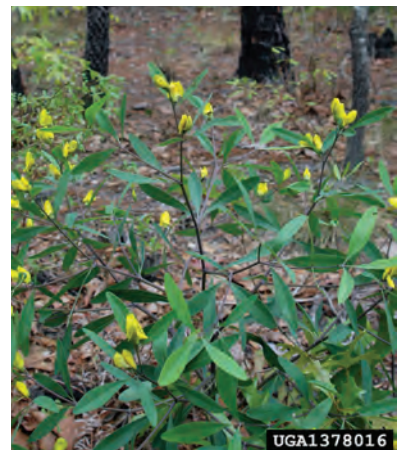
Baptisia lanceolata