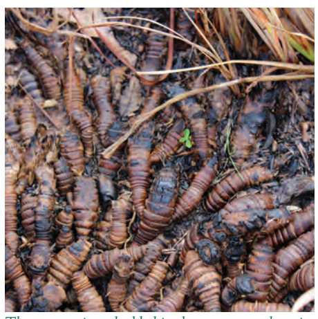
The answer is embedded in the text somewhere in this newsletter.

Ok, so I'm not very pretty, but really, you've caught me at a bad time. I am a warm season native grass, so summer is my time to shine. You can find me growing along road margins and blooming in June through August. I am fashionably tall (up to six feet), and my flowers are among the more interesting in the grasses (actually I have two different types of flowers). My seeds are large and they mature from the terminal end of my racemes. As soon as a seed reaches maturity, I send it on its way, so if you plan to gather my seeds, you have to be very attentive to me, like dropping by every couple of days to visit. I am a sturdy, long-lived perennial, and I stand my ground very, very well!