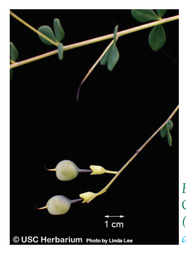
Baptisia tinctoria.