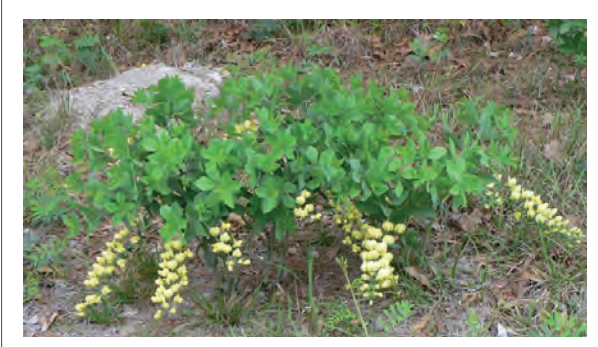
Baptisia bracteata in bloom.