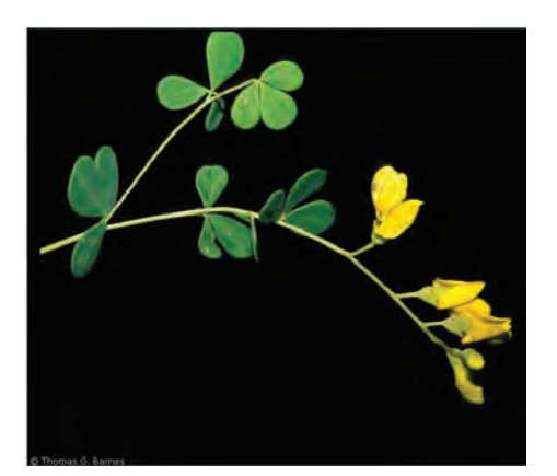
Baptisia tinctoria, courtesy of Tom Barnes, via http://plants.usda.gov