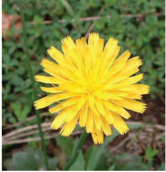
Figure 2. Cat's ear (Hypochaeris radicata)

chicory, although its range doesn't extend as far west as the desert states. All three plants make spherical clusters of "parachuted" fruits that scatter about on the wind.