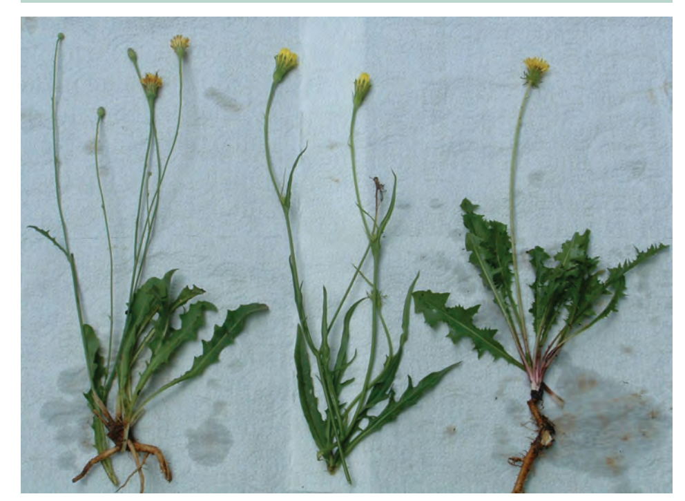
Figure 4. From left, Cat's Ear, Carolina False Dandelion, and True Dandelion.

its base. But with close inspection, these, like Hairy Cat's Ear, can be distinguished from Carolina False and "True" Dandelions.