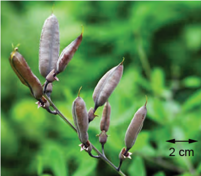
Baptisia albescens

much like a small eucalyptus. The bright yellow flowers are borne singly in the axil between the leaf and the stem. Sturdy round pods (up to ½ inch in diameter) are formed, and contain as many as four seeds per pod. The common name is derived from the appearance of the seed pods. Catbells is found only in the lower fringe of the Piedmont and the Sandhills.