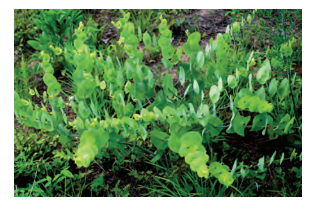
Baptisia perfoliata, courtesy of the author.