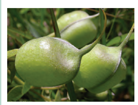
Baptisia bracteata pods.