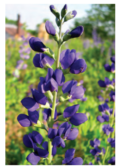
Baptisia australis.