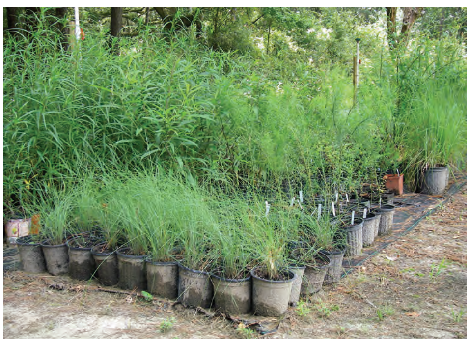
Figure 5. Plants grown by Karl Ohlandt for landscaping and restoration projects.

Rosengarten, D., T. Rosengarten, E. Schildkrout, 2008. <u>Grass roots:</u> <u>African origins of an American art.</u> New York: Museum for African Art.