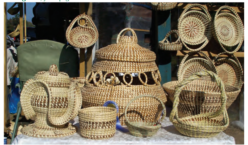
Figure 2. This display on Highway 17 shows the variety of styles and forms that basket makers create with different combinations of native plants.

describe three of the plants they use as relatively abundant. Bulrush is a dominant species in freshwater and brackish marshes, long-leaf pine is found in rural areas, and palmetto, the South Carolina state tree, has long been a popular landscaping choice among homeowners. Sweetgrass, however, has become increasingly difficult to find because it grows in flats between coastal dunes and in maritime wet grasslands (Ohlandt 1992), landscapes that are popular sites for tourism development and private neighborhoods. While basket makers describe how sweetgrass has been 'paved over', they also point out that several neighborhoods have preserved or restored sweetgrass habitat and the plant has reappeared in yards and along roadsides as a popular ornamental prized for it's feathery-purple fall blooms (Hurley et al. 2008) [see Fig. 3]. Basket makers associate sweetgrass 'scarcity' with changing definitions of landownership and community that restrict access to all four plants, but these changes have made sweetgrass harvesting particularly difficult.