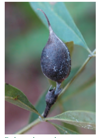
B. lanceolata pod