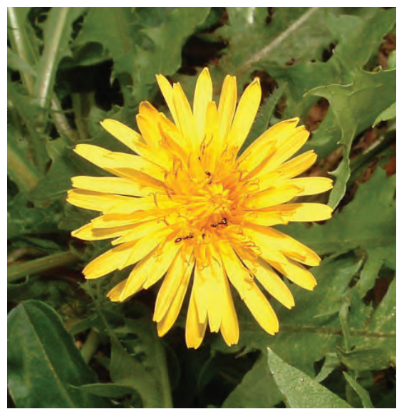
Figure 1. "True" dandelion (Taraxacum officinale)

If you ever notice commercials for herbicides, it seems to be "Round-up" time for dandelions just about all year long now. Especially if you are trying to maintain an ecologically unstable monoculture called a lawn. But dandelions have at least two look-a-likes in our area, which can be considered second cousins once, maybe twice, removed from the common dandelion (or what I like to call "true" dandelion) (Figure 1), which is naturalized from Europe.