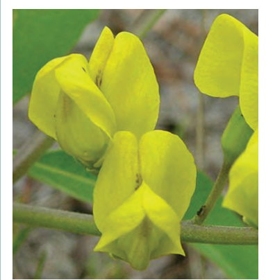
Baptisia cinerea.