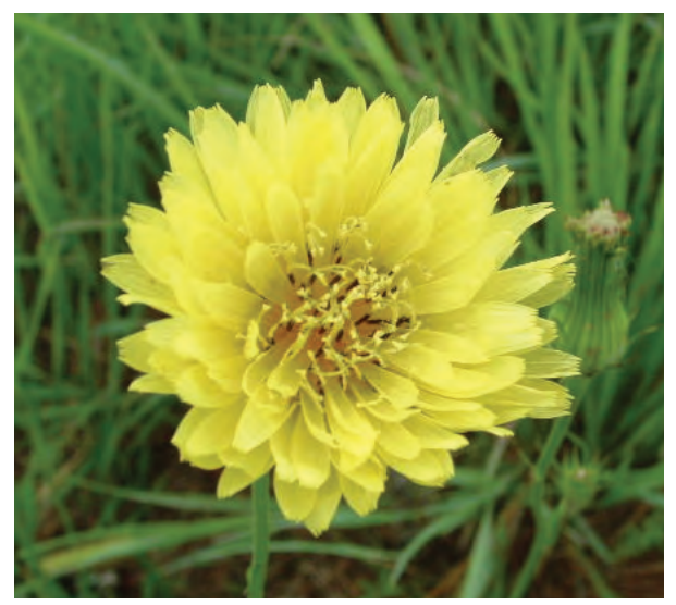
Figure 3. Carolina false dandelion (Pyrropappus carolinianus).

The scientific name for "True" Dandelion, Taraxacum officinale , comes from Greek words, taraxos=disorder, akos=remedy, and officinale = official. Therefore, the dandelion, disdained star of herbicide commercials, is actually a long time proven "official" remedy for kidney, digestive and liver disorders. The