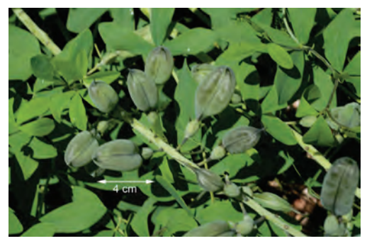
Baptisia australis.