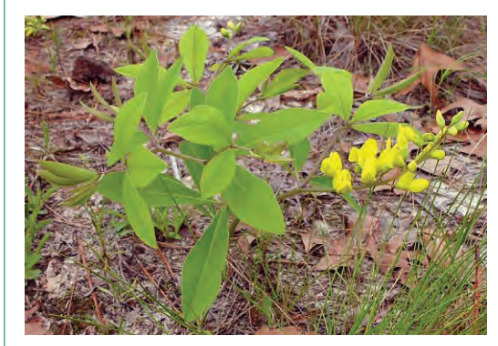
Baptisia cinerea.