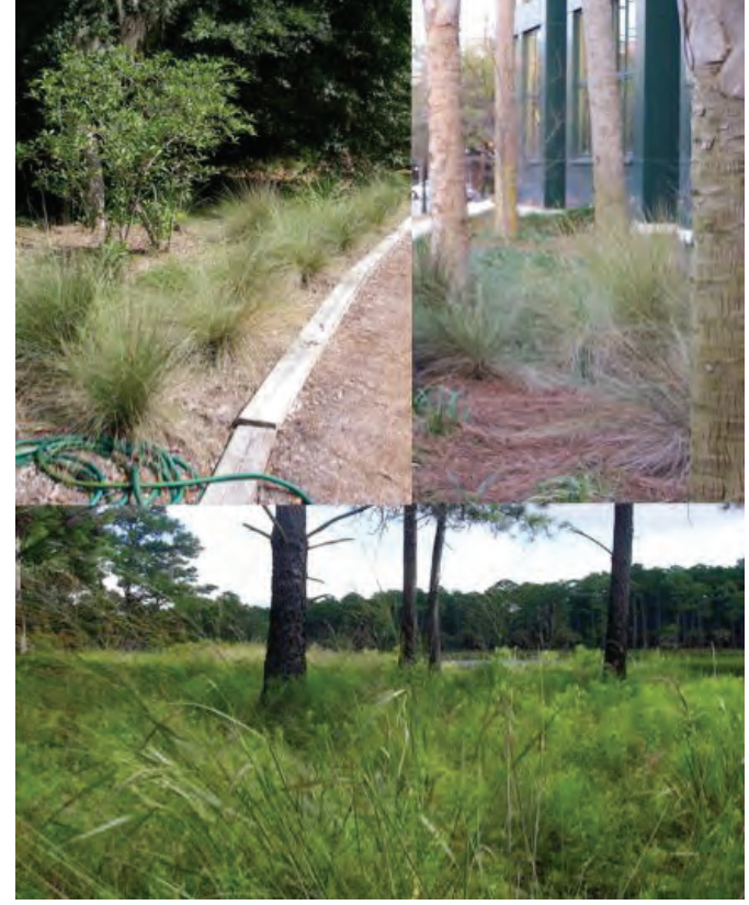
Figure 3. Clockwise from top left: Sweetgrass planted along a driveway on Spring Island, beneath palmetto trees in front of Addlestone Library at the College of Charleston, in a restoration site on Spring Island.

Beyond the relationships between harvesting and plant health, plant scientists have also become interested in basket maker knowledge of cultivation and geographic variability. As local supplies of wild sweetgrass dwindle, harvesting trips have expanded to include nearby states. Some basket makers can describe geographically specific characteristics of sweetgrass and can tell the difference between wild and cultivated plants. Citadel botanist Dr. Danny Gustafson is concerned that sweetgrass grown from seeds harvested in other parts of the country may have a negative effect on the persistence of