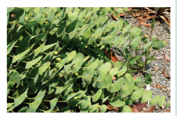
Baptisia perfoliata fruit