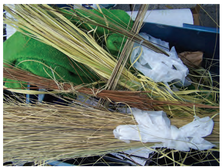
Figure 1. From top to bottom: bulrush needles, strips of palmetto leaves, long-leaf pine needles, and blades of sweetgrass.

In and around the town of Mount Pleasant, SC, African American women and men make baskets using techniques developed by their West African ancestors, who adapted those methods to New World plants on lowcountry rice plantations (Rosengarten et al. 2008). The plant materials used to make these baskets