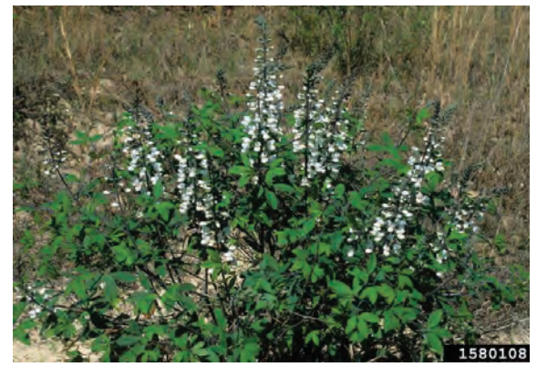
Baptisia alba