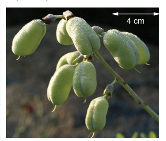
Baptisia alba pods